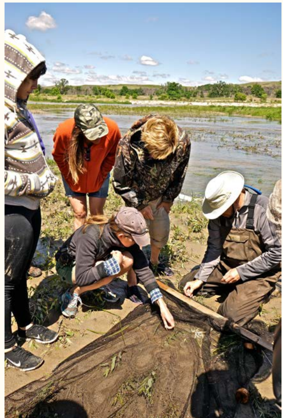
Niobrara Valley Preserve 2014

The science and art of becoming informed stewards of the environmental world we live in. The Mission Statement of the Program is that it “educates a volunteer network dedicated to promoting the conservation of Nebraska’s natural resources.” Why does the environment need such people? Those who care about the environment have not had the good fortune to discover a money tree yet. An example of that fact was the temporary closing of nearly 30 state parks in 2013 by Nebraska Game and Parks. Most environmental programs cannot begin to reach their full potential without volunteers. They can be the beating heart of many programs and the Nebraska Master Naturalist Program is a wonderful way to provide trained volunteers.