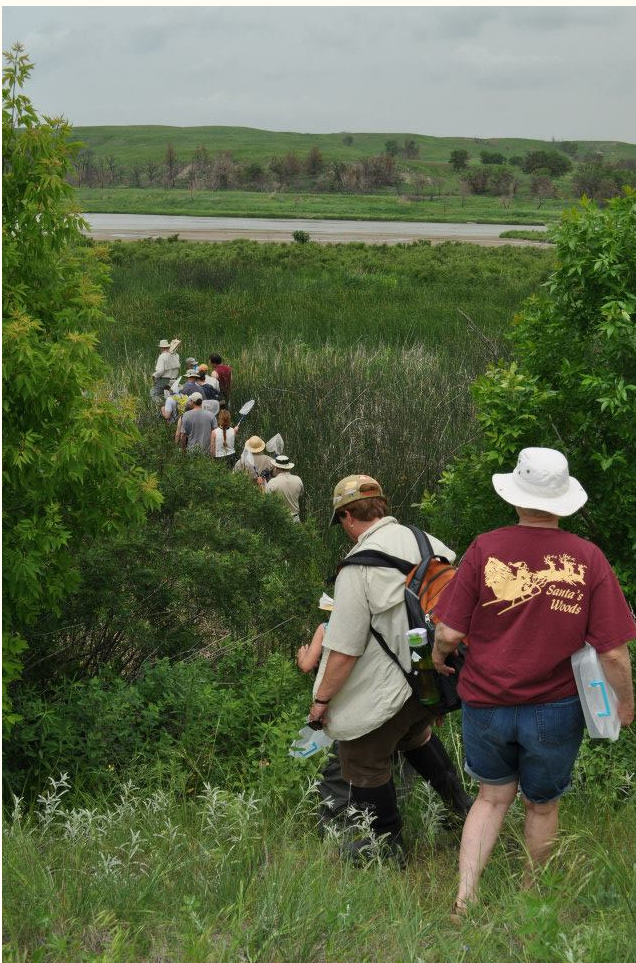
Niobrara Valley Preserve 2014