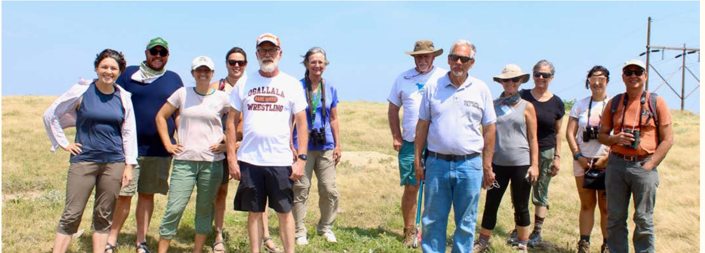
July 2021 Training Class, Cedar Point Biological Station.