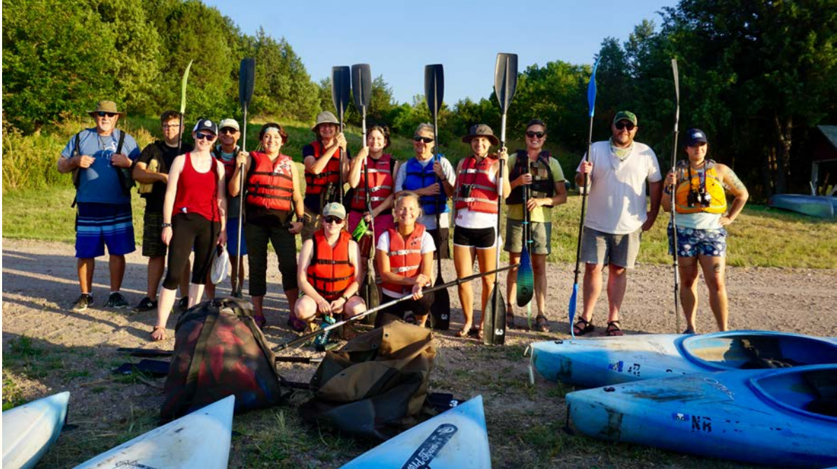
2021 Cedar Point Biological Station

Please consider supporting the future of the Nebraska Master Naturalist Program by donating today. Your commitment will go a long way to protect conservation and education in Nebraska!